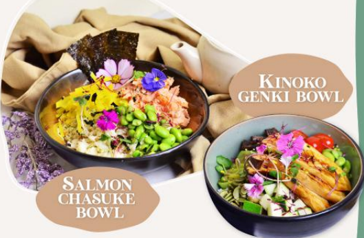
SALMON CHASUKE BOWL