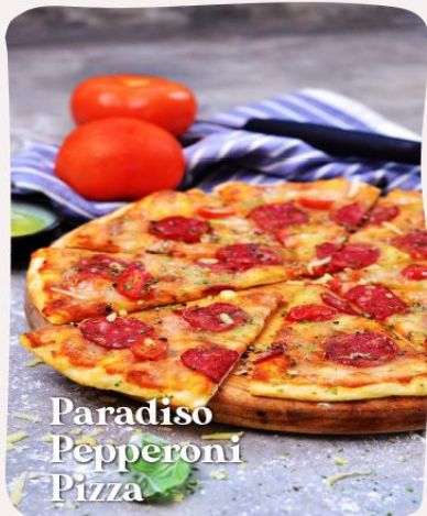
Paradiso Pepperoni Pizza