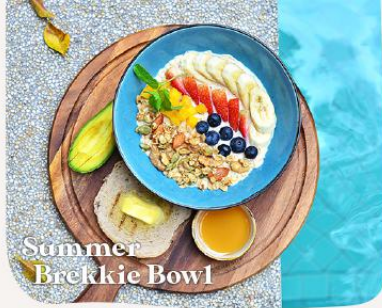
Summer Brekkie Bowl

Baked Beans & Mushroom topped with Ricotta Cheese, served with Herby Yogurt Granola Sourdough Toast & Balsamic Vinaigrette Arugula Salad.